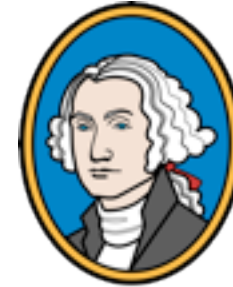
GEORGE WASHINGTON 1732-1799