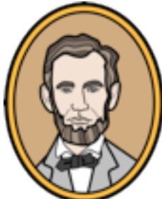
ABRAHAM LINCOLN 1809-1865