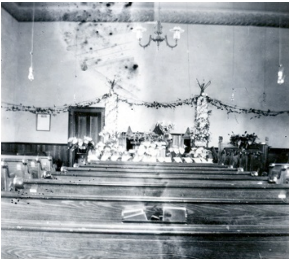
The Old Church at Easter