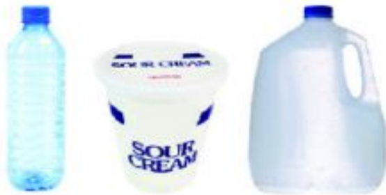
PLASTIC BOTTLES, TUBS, AND JUGS BOTELLAS, BALDES Y JARRAS DE PLÁSTICO