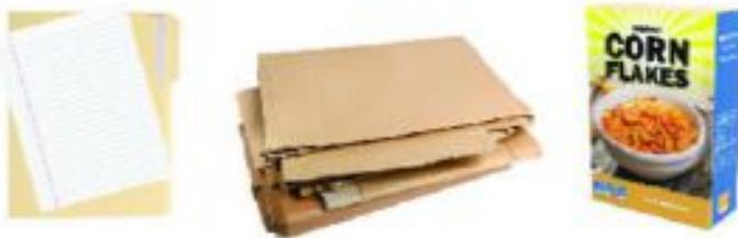
PAPER AND CARDBOARD PAPEL Y CARTÓN