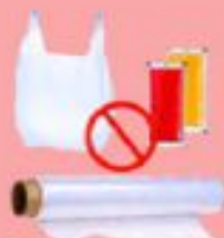
NO SINGLE-USE PLASTIC PLÁSTICO DE UN SOLO USO NO