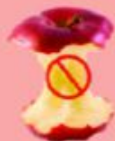
NO FOOD COMIDA NO