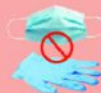
NO PPE EPP NO