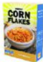
PAPER AND CARDBOARD PAPEL Y CARTÓN