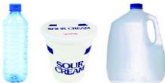
PLASTIC BOTTLES, TUBS, AND JUGS BOTELLAS, BALDES Y JARRAS DE PLÁSTICO