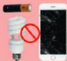
NO HAZARDOUS OR ELECTRONIC WASTE DESECHOS PELIGROSOS O ELECTRÓNICOS NO