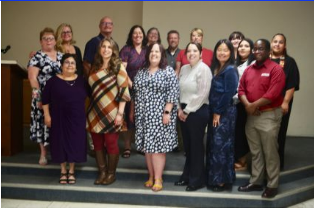
2025 Ross-Harmon Educator of the Year Honorees and those who took the time to nominate them.