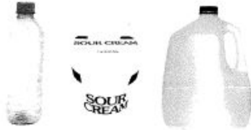
PLASTIC BOTTLES, TUBS, AND JUGS

R Recology Butte Colusa Counties WASTE ZERO