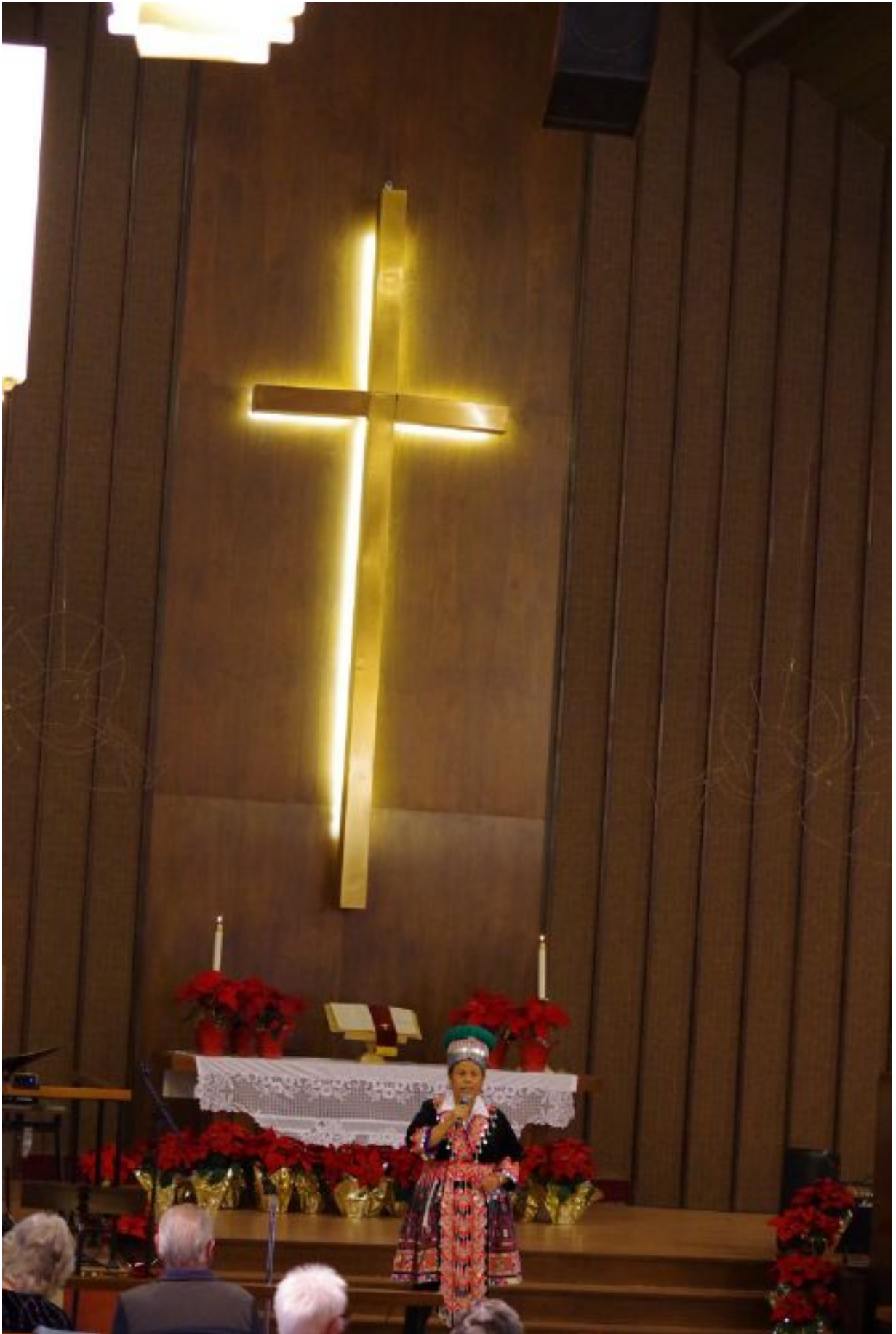
January 2024 OROVILLE FIRST UNITED METHODIST CHURCH GOLDEN FEATHER