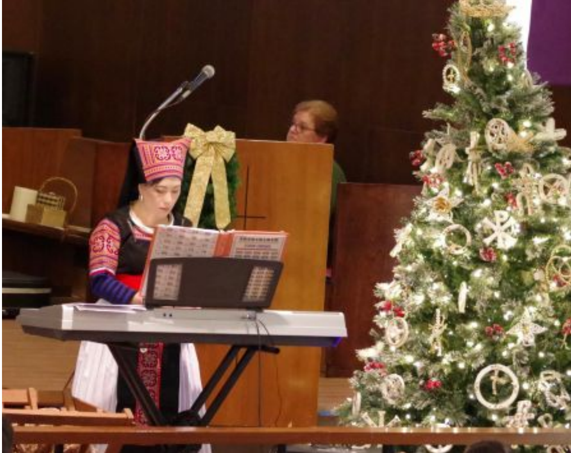
January 2024 OROVILLE FIRST UNITED METHODIST CHURCH GOLDEN FEATHER