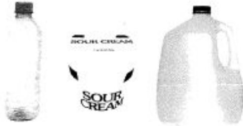
PLASTIC BOTTLES, TUBS, AND JUGS

R Recology Butte Colusa Counties WASTE ZERO