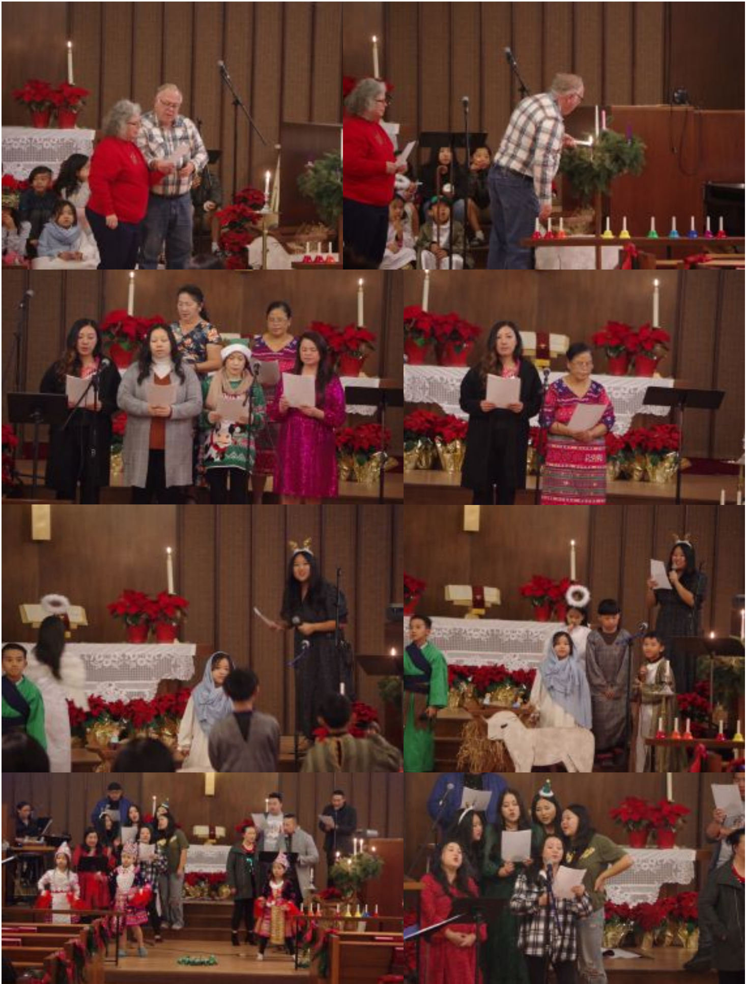
January 2024 OROVILLE FIRST UNITED METHODIST CHURCH GOLDEN FEATHER