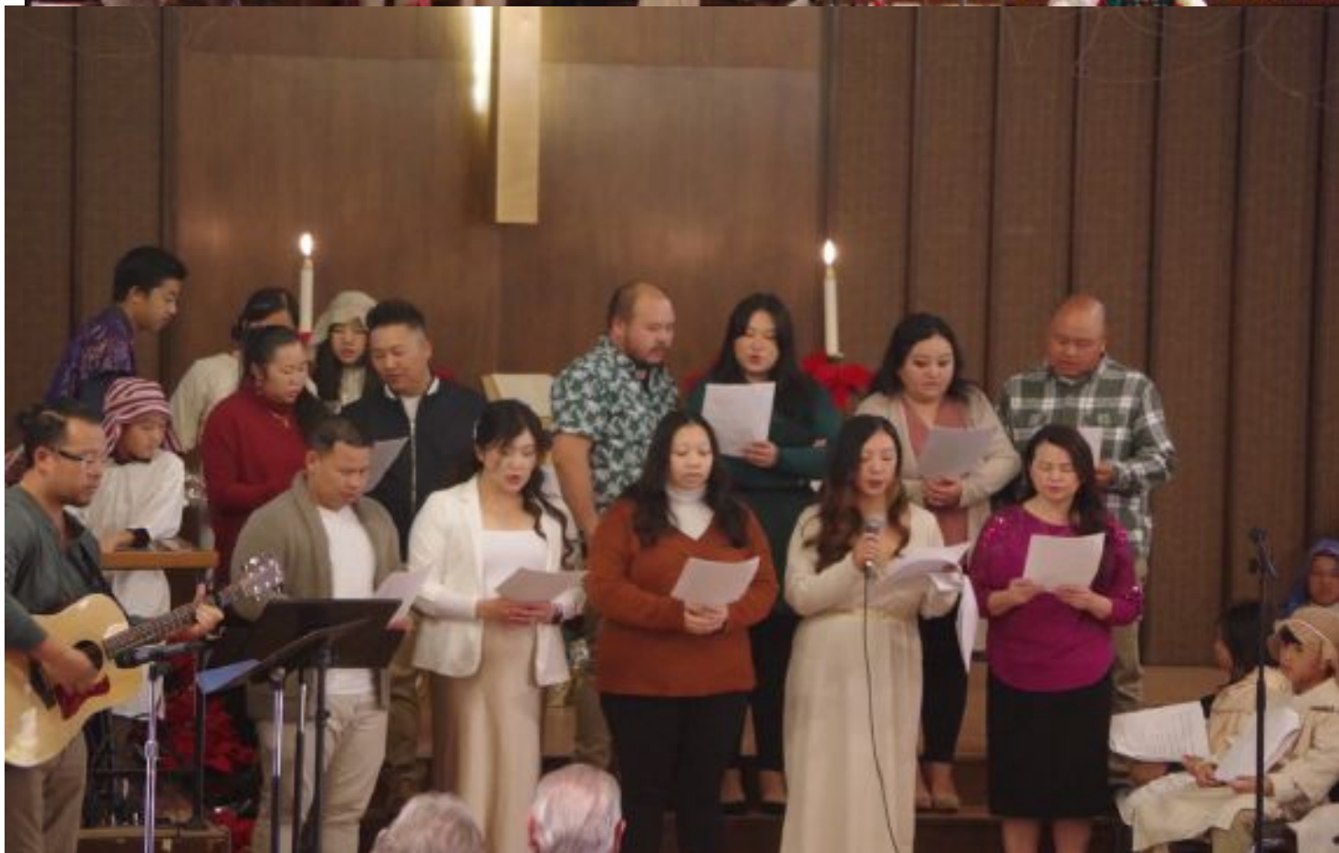
January 2024 OROVILLE FIRST UNITED METHODIST CHURCH GOLDEN FEATHER