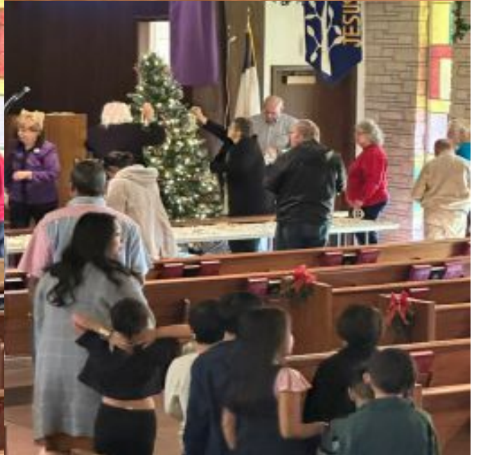
January 2024 OROVILLE FIRST UNITED METHODIST CHURCH GOLDEN FEATHER