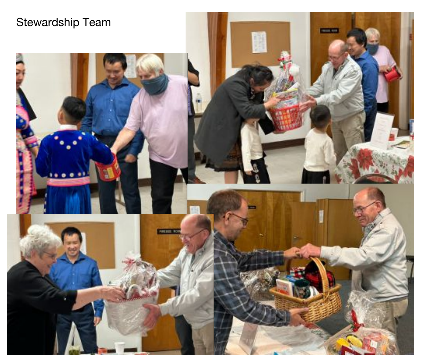
September 2023 OROVILLE FIRST UNITED METHODIST CHURCH GOLDEN FEATHER