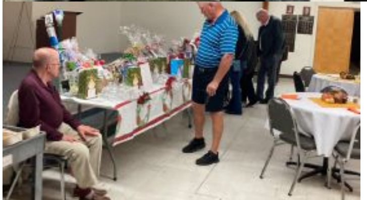
December 2023 OROVILLE FIRST UNITED METHODIST CHURCH GOLDEN FEATHER