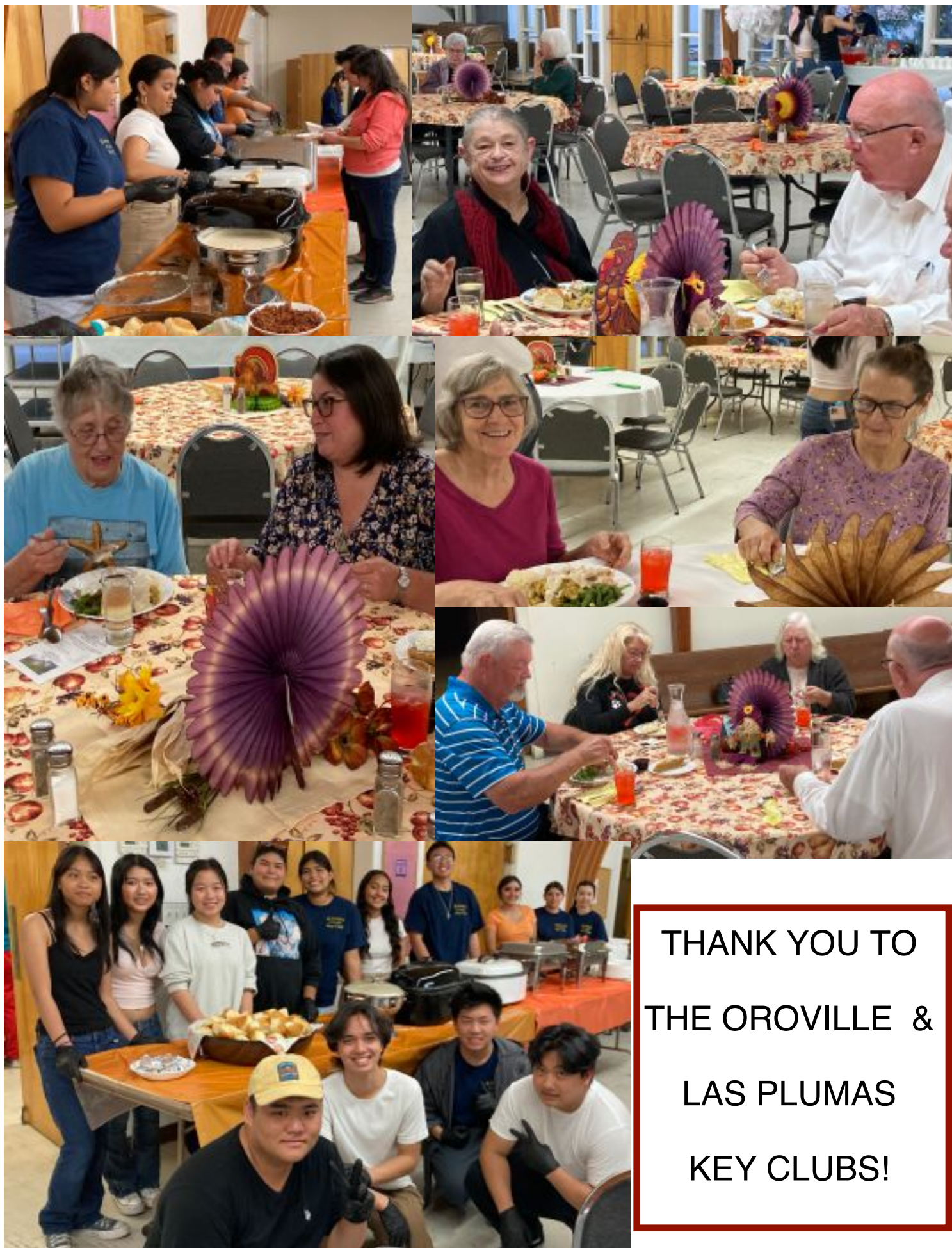
December 2023 OROVILLE FIRST UNITED METHODIST CHURCH GOLDEN FEATHER